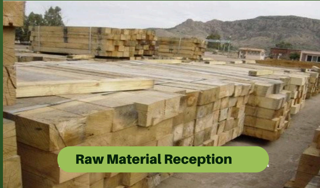
Raw Material Reception